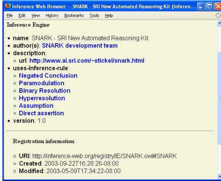
Fig. 2. Browsing metadata about an inference engine called SNARK.